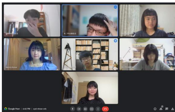
Picture: One of the times when we had an online meeting

In conclusion, I found it so much fun of exchanging the ideas of global issues crossing the borders and working on one project by having online meetings. WYM of this year is ended, but I'll keep in touch with my Taiwanese friends, and I want to cherish this new friendship. Moreover, I'll cherish each moment of the present, and join such online events positively.